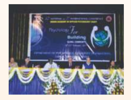
Glimpses from the International Conference by Department of Psychology, UOR on Psychology For Building Global Community, 23rd -25th February, 2017

The faculty members and researchers of the department have also made significant research contribution in these fields and are also involved in development of Psychological Measurement Devices. The Department is well-known for its excellence in academic and research programs in various areas of Psychology. A significant number of alumni of this Department are working on high positions in National and International Institutes as well as in Government Administrative services. The Department attracts students from Rajasthan and outside, including International students. The Department has been a recipient of various Grants from National agencies including UGC.