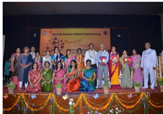
Glimpses from the conference by Department of Psychology, UOR on Pursuit of Happiness- A Journey to Healthy Living, 1-2 March, 2016

The faculty members and researchers of the department have also made significant research contribution in these fields and are also involved in development of Psychological Measurement Devices. The Department is well-known for its excellence in academic & Research programs in various areas of Psychology. A significant number of alumni of this Department are working on high positions in National and International Institutes as well as in Government Administrative services. The Department attracts students from Rajasthan and outside, including International students. The Department has been a recipient of various Grants from National agencies including UGC.